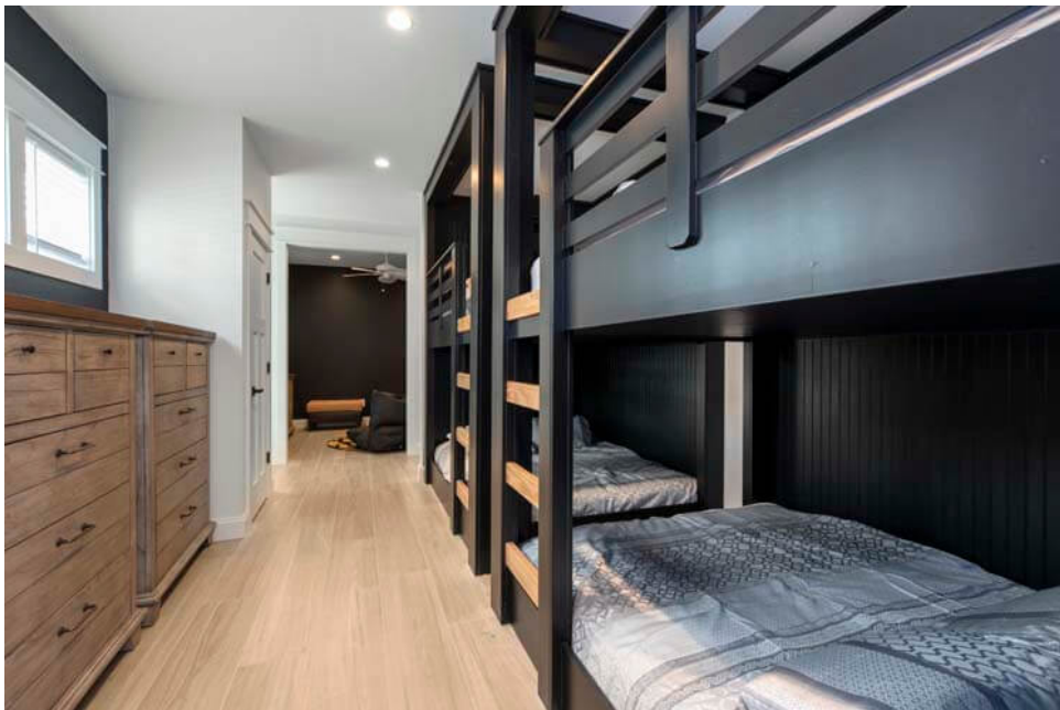
Queen Bunks, 4 Person Occupancy, 2 Private Baths Bottom Queen Bunks, Each Sleeps 1 $550 per person Top Queen Bunks, Each Sleeps 1 $525 per person

*Note: Adjoining Media Room will host two sleepover spots who will share Bunk Suite baths