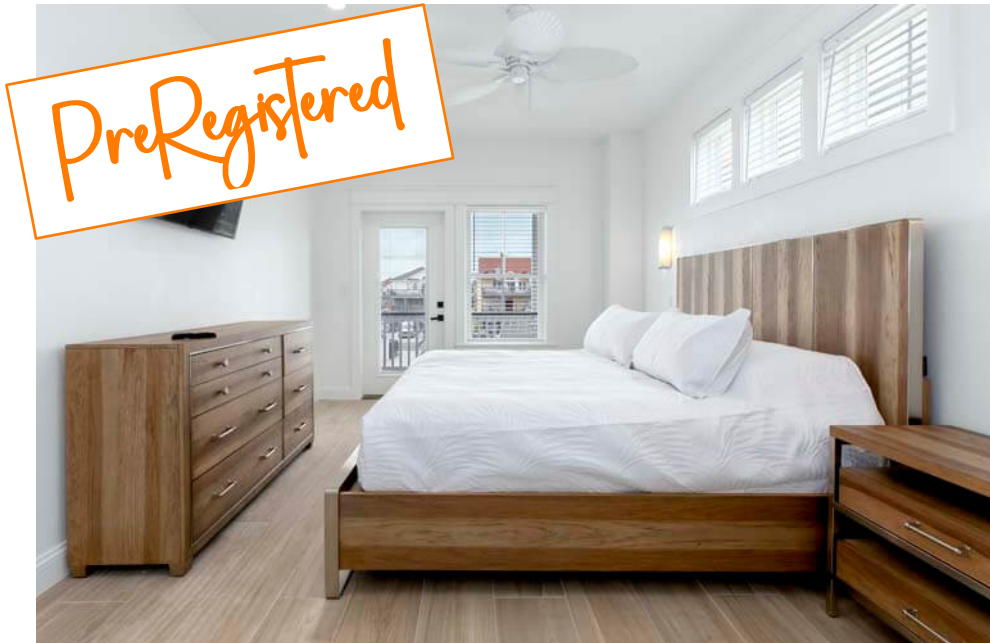
King Bed/Double Occupancy, House Front Balcony, Private Bath $750 per person