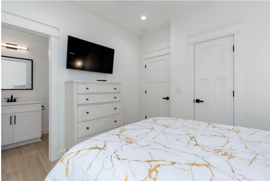
Queen Bed/Double Occupancy, Private Bath $625 per person