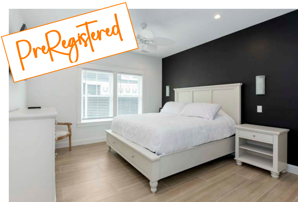
King Bed/Double Occupancy, Private Bath $675 per person