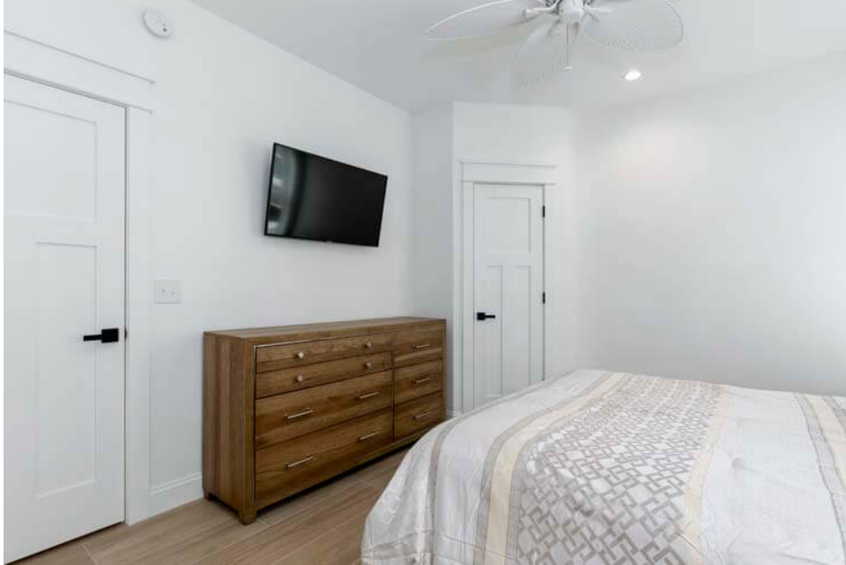
Queen Bed/Double Occupancy, Private Bath $625 per person