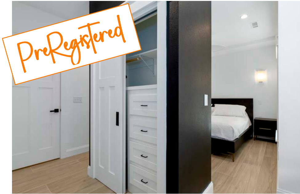
King Bed/Double Occupancy, Private Bath Double Vanity $750 per person